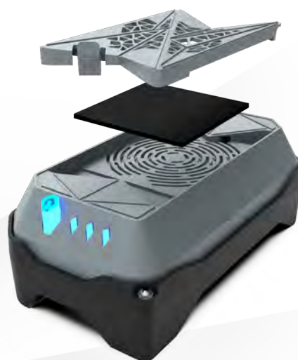
Easy access for dust filter maintenance