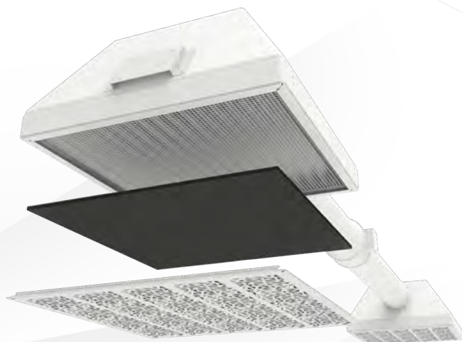
Easy access for dust filter maintenance